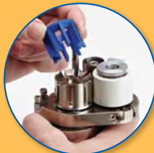
Remove used blade cartridge