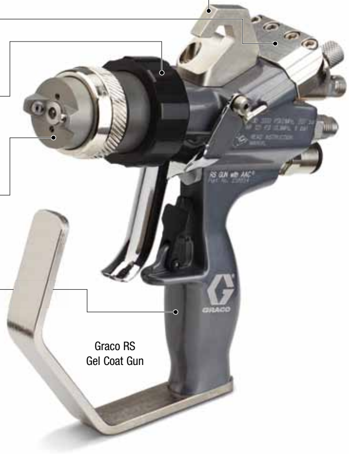
Graco RS Chop Guns and Graco RS Gel Coat Guns are both available in internal and external mix models