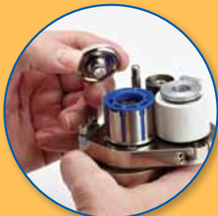
Remove locking mechanism