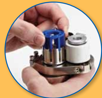
Replace with new blade cartridge