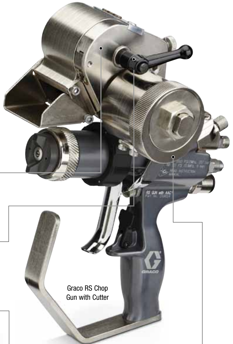
Graco RS Chop Gun with Cutter